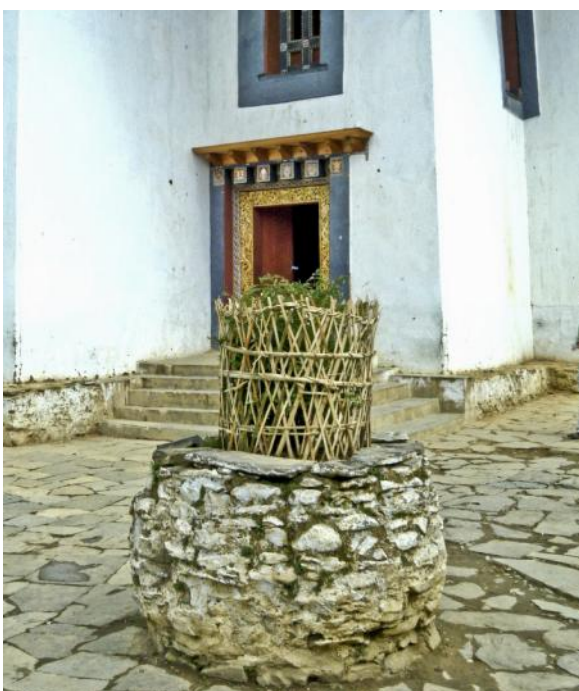
Protection for a young tree peony at a Bhutanese monastery

I recommend two websites: The Canadian Peony Society http://www.peony.ca/ and Ferncliff Gardens, where I have purchased very good plants, http://www.ferncliffgardens.com/Peonies.php ♪