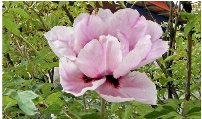
A Bhutanese tree peony.

Whenever I see a peony I think of the old gardens found in the towns and villages of Nova Scotia. Every flower garden had a peony, usually three: a pink one, a white one, and a red one. They were often added to the vegetable garden, along with gladiolus, as flowers for the house or the church.