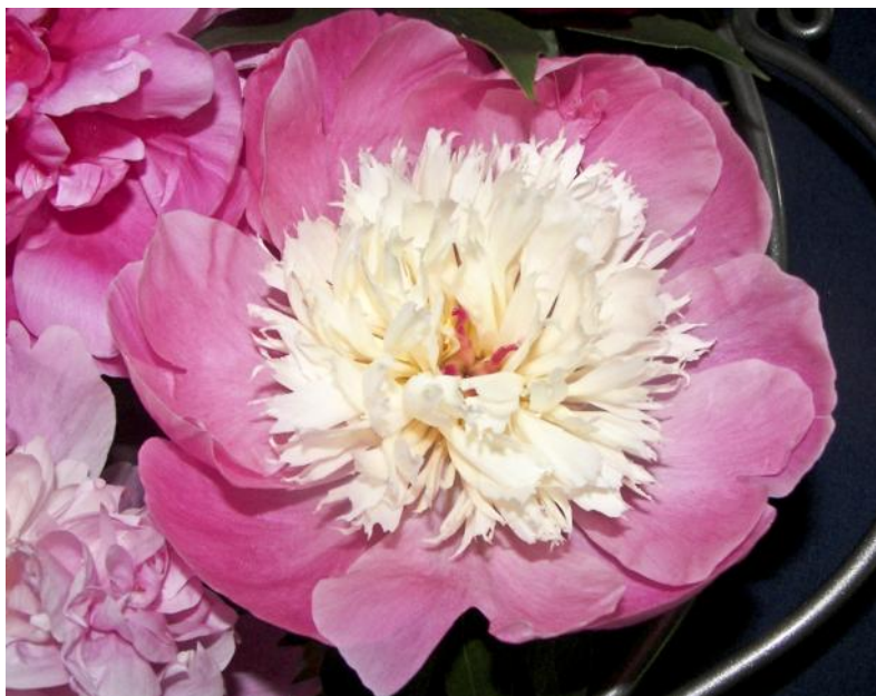
'Bowl of Beauty'

Peonies have very few problems but, like all plants, will only perform at their best if given a good start. They should be planted in a rich, well drained soil. Plant them so the eye is only two to three inches below soil level. Like rhododendrons, if planted too deep they often won't bloom. Every autumn I give my peonies a side-dressing of bonemeal. In spring they are given a weak drink of a balanced fertilizer. Like roses, peonies need about six hours of sun each day. The biggest problem I have with peonies here in Victoria BC is late frost. If the buds are frosted they will shrivel and won't open up.