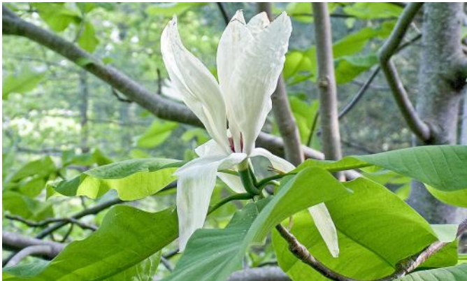
Magnolia tripetala .