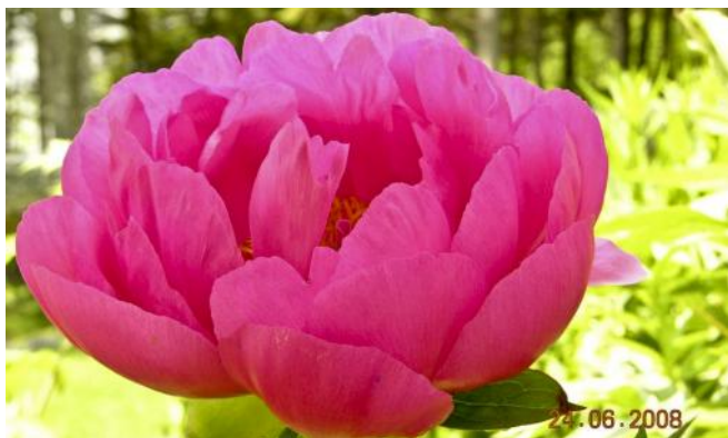
Paeonia mlokosewitschi