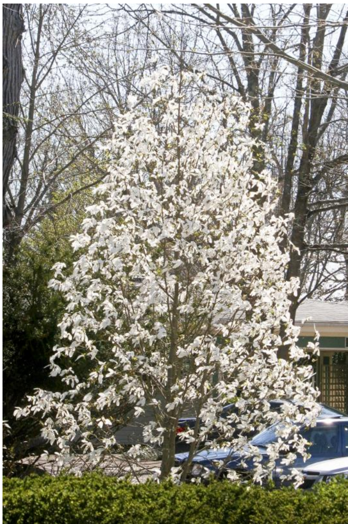
Magnolia 'Wada's Memory'

Another of my personal favourites is M. sieboldii or Oyama Magnolia. This flowers in May and June and repeats throughout the summer. It has lovely egg-shaped buds that open to nodding fragrant white flowers with red stamens. The oval red fruit continues the show into autumn against the golden fall-coloured leaves. Set on the front lawn of the Gardens, this magnolia does well in the shade of our large trees.