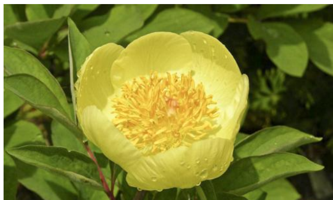
Paeonia mlokosewitschi