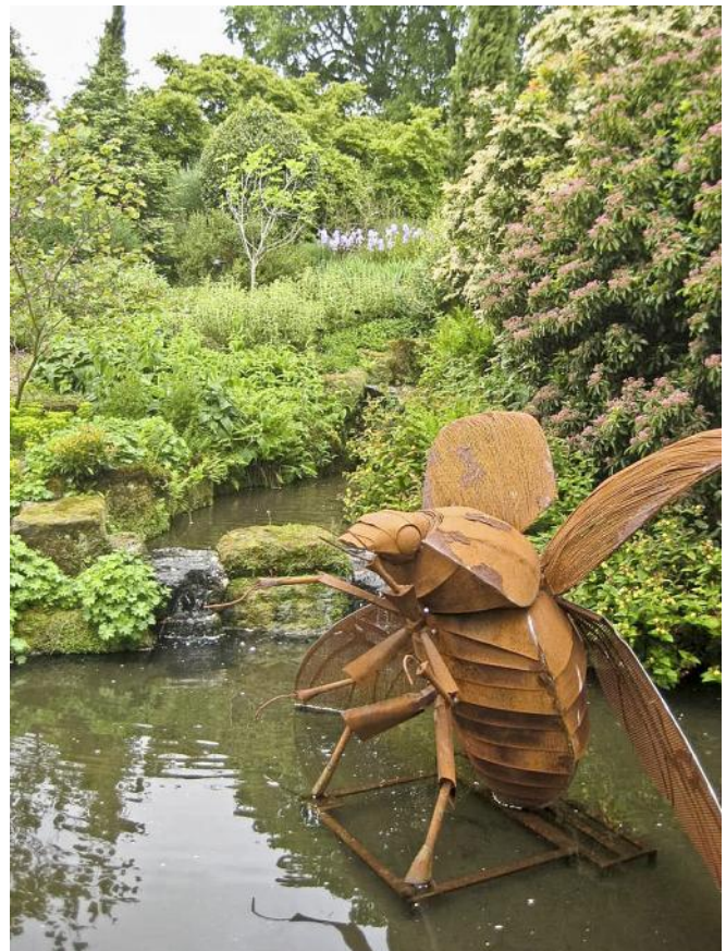
More London Wetlands