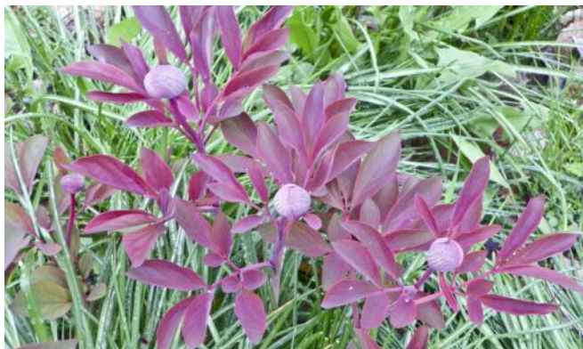
Species Peony buds.