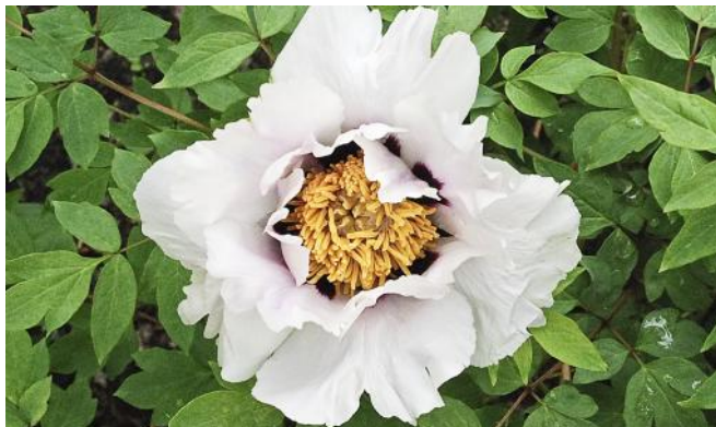
A tree peony from Bryson-Wilgenhof stock