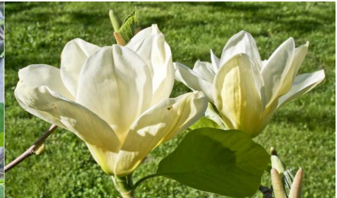
Magnolia 'Elizabeth'

The Annapolis Royal Historic Gardens is home to over 25 species and cultivars of magnolia, many of them donated to us over the years by the Atlantic Rhododendron & Horticultural Society.