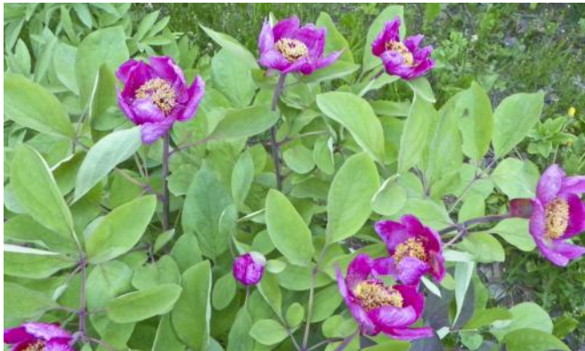
A species peony at the Willow Garden.